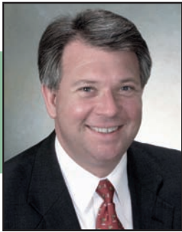
State Senator JOHN WOZNIAK